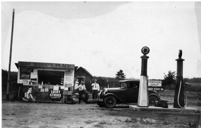
*Dad Sharp's Place circa 1925.

After Dan Sharp's Farm became more of an area landmark trading post of sorts than an actual farm, "Dad Sharp's Place" began in 1923 as a small local produce stand, roadside cookshack, tiny grocery store & early gas station for White Star gasoline (later, Gulf gasoline) for the area's residents and early vacationers. Continuing in the construction trades, Dan Sharp also was heavily involved in building many of Higgins Lake's early cottages, road construction, as well as helping build the (South) Higgins Lake Park Store with the CCC in 1935 & later the "Ralph A. McMullen" center lodge (North State Park) projects.