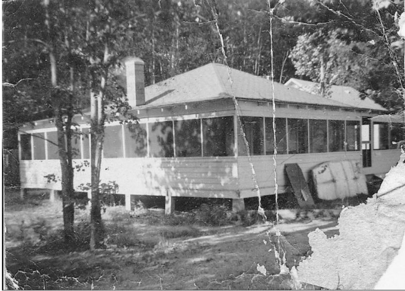
*Sharp's "Sylvan Beach" lake house cottage circa 1920. Its original location is roughly where campsite #143 in the S. Higgins Lake State Park is today. It was moved outside of the park to the west- just on the other side of the park's fence of campsite #470 location today. It has been recently renovated & continues to serve as a historical vacation rental retaining much of its original appearance as it did in 1920.